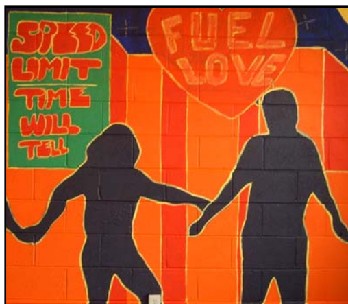
Detail of EXPLORE mural

The youth and families of the Northeast are at risk and in need of services. The area suffers from a rate of unemployment 10% higher than in the rest of Kansas City. Area youth have high rates of gang involvement and school abandonment, with 25% of the population failing to earn a high school diploma or GED. Mattie Rhodes Center has emerged as an area leader in advocacy efforts and is committed to serving the community by continuing to plan activities designed to prevent family violence by engaging youth and coordinating with Vida en Balance (Life in Balance), a Latino parenting education class, and Visions with Hope 360° , support for families of children with special needs.